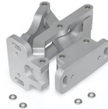
Heavy Duty Aluminum Door Hinges