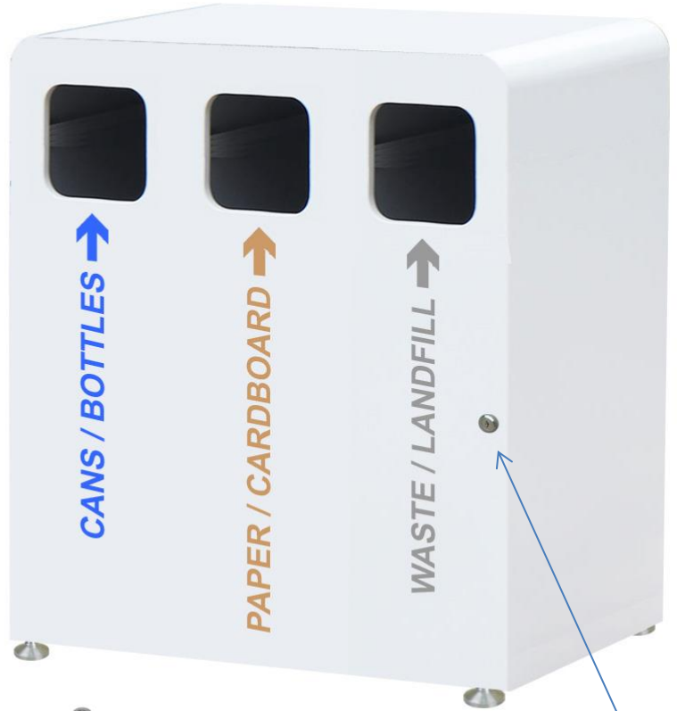
Hex Security Lock

3-Multi-Stream Recycling Station. Fabricated from 100% aluminum with a powder coated finish. Single, reinforced front door with heavy duty commercial grade aluminum hinges. Opening access w/hex security locking mechanism. Removable durable inside galvanized 100% recycled steel liners. Stainless steel adjustable glides.